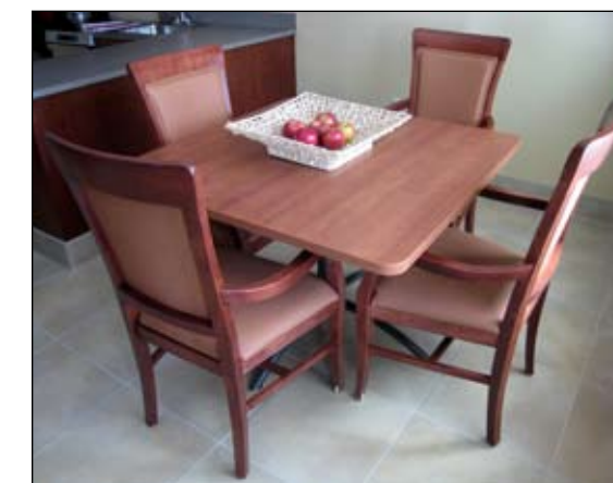
The private Hospice House kitchenettes give residents and visitors a cozy place to share a meal.