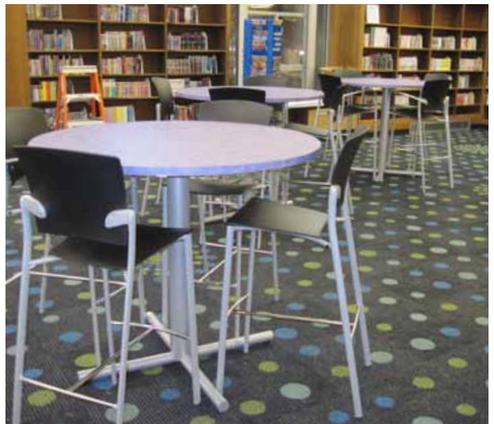
shown: Axis table with custom laminte surface