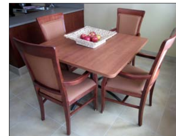
The private Hospice House kitchenettes give residents and visitors a cozy place to share a meal.