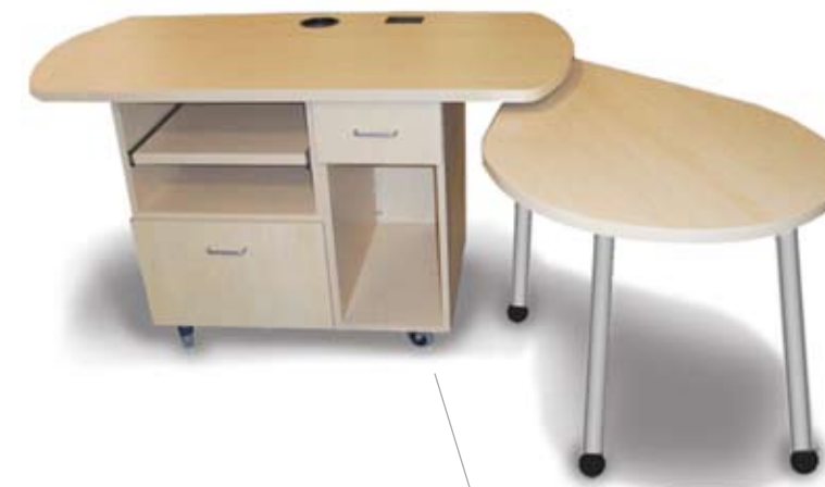
The locking casters on the storage unit and the swing around workspace provide easy mobility.