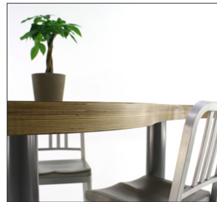
2.25" exposed edge.

Vanerum Stelter Studio worked through nine iterations with the designer and end user. As the landscape of the collaboration zone took shape, the furniture adapted to meet aesthetic and budgetary needs as well. The end result was a counter height, two inch thick exposed edge amoeba shape worksurface.